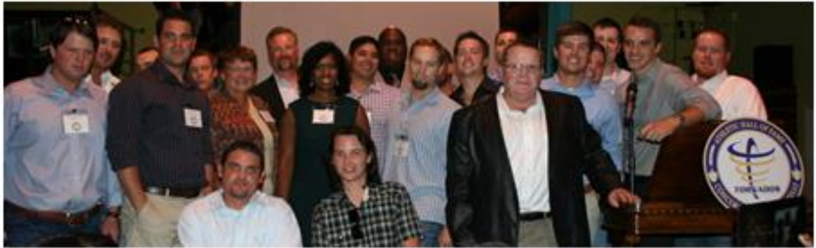
CTX Alumni Association

The CTX Alumni Association exists not only to allow graduates to remain connected, but to support the University in its mission to develop Christian leaders. There are various ways to remain connected with us. Each month you will receive our monthly newsletter, News from the Pier , via email. Also, watch your postal mail every quarter for the Concordia University Texas Magazine .